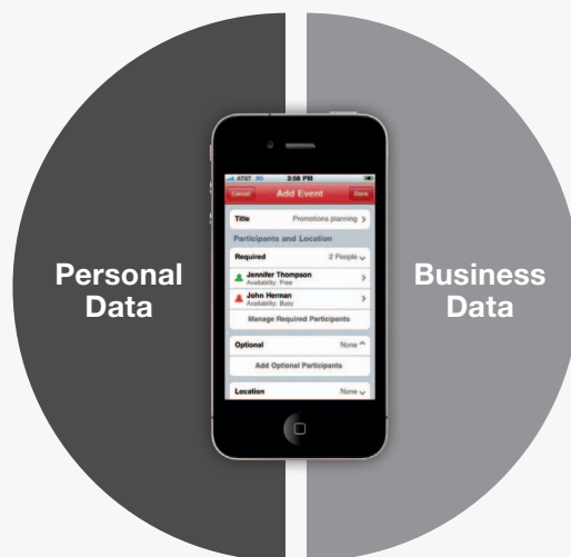
Good's security container separates company and personal information.